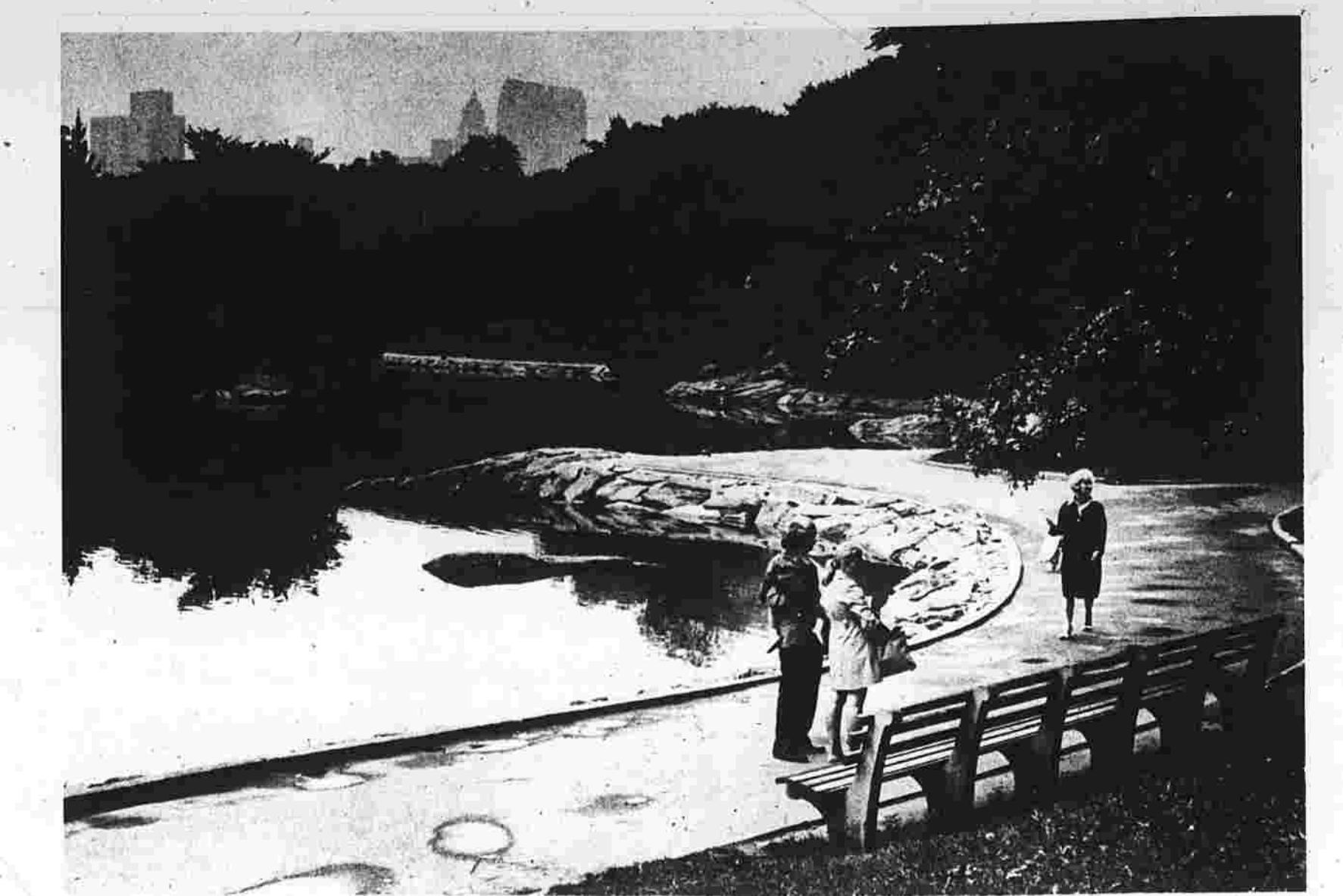
IN NEW YORK'S CENTRAL PARK