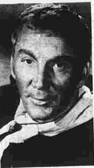
Cameron Mitchell co-stars in "High Chaparral" Fridays on Channel 30.

1:00 (3) Virginia Graham Show (C) (8) Mike Douglas Show (C) (30) Tales of Wells Fargo (C) (40) All My Children (C) 1:30 (3) As the World Turns (C) (30) Words and Music (C) (8-40) Let's Make a Deal (C) 2:00 (3) Love Is a Many Splendored Thing (C) (30) Days of Our Lives (C) (8-40) Newlywed Game (C) 2:30 (3) Guiding Light (C) (30) The Doctors (C) (8-40) Dating Game (C) 3:00 (3) Beverly Hillsbillies (C) (30) Another World—Bay City (C) (8-40) General Hospital (C) 3:30 (3) Family Affair (C) (30) Bright Promise (C) (8-40) One Life to Live (C) 4:00 (3) Ranger Station (C) (30) Another World—Somerset (C) (8-40) Dark Shadows (C) 4:30 (3) Hazel (C) (8) David Frost Show (C) (30) Mr. Ed (C) (40) Flinstones (C) 4:50 (3) Sewing Show (C) 5:00 (3) Perry Mason (C) (18) Wild Wild West (C) (30) Addams Family (C) (40) Gilligan's Island (C) (40) Weather Watch (C) 5:25 (40) Gilligan's Island (C) 5:30 (40) What's My Line? (C) 6:00 (3-8-40) Weather — Sports and News (C) (18) Dick Van Dyke (C) (30) To Tell the Truth (C) 6:05 (40) Rawhide (C) 6:30 (3) News with Walter Cronkite (C) (8) News with Frank Reynolds and Howard K. Smith (C) (18) Candid Camera (C) (30) NBC News (C) 7:00 (3) To Rome With Love (C) (8) Truth or Consequences (C) (18) What's My Line? (C) (30-40) News — Weather and Sports