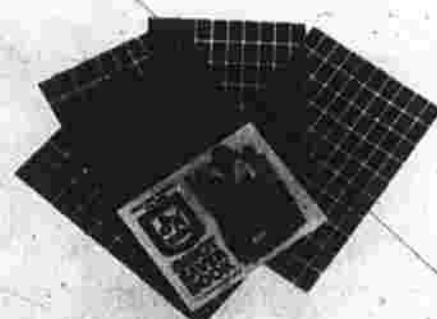
1000 S & H GREEN STAMPS so you may select the gift of your choice

Choose one of these Gifts when you open a NEW Savings Account of $50 or more at our No. End Office **